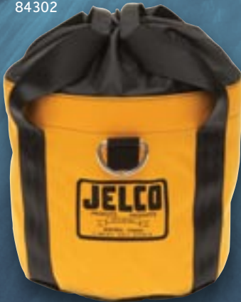
Gold and Black Round Hose Bag 84302