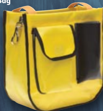
Yellow Vintex Bolt Bag 84540