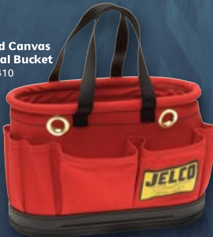
Red Canvas Oval Bucket 84410