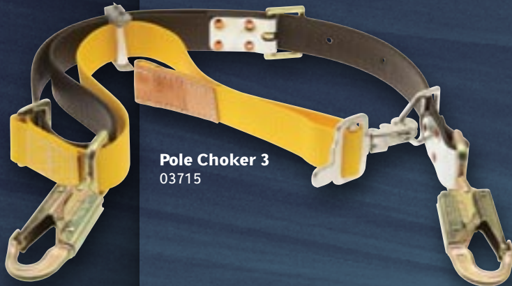
Pole Choker 3 03715