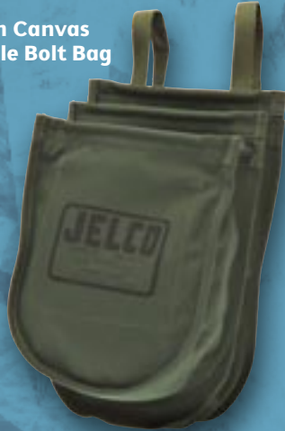
Green Canvas Double Bolt Bag 84501