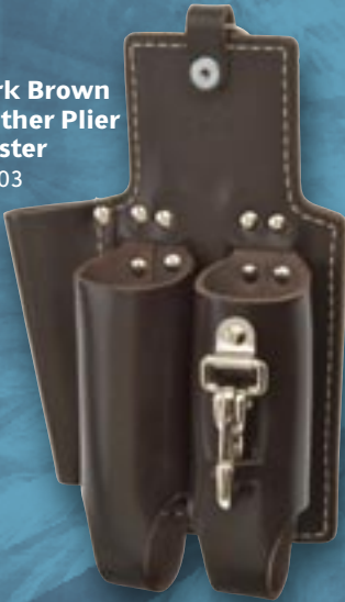
Dark Brown Leather Plier Holster 84603