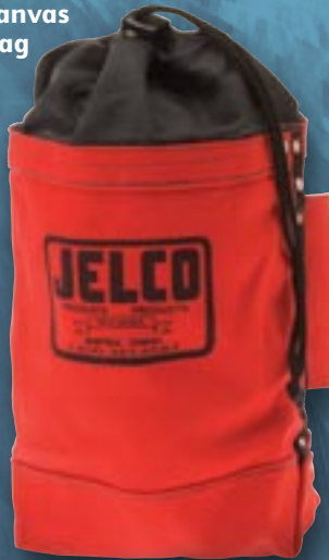
Red Canvas Bolt Bag 84521