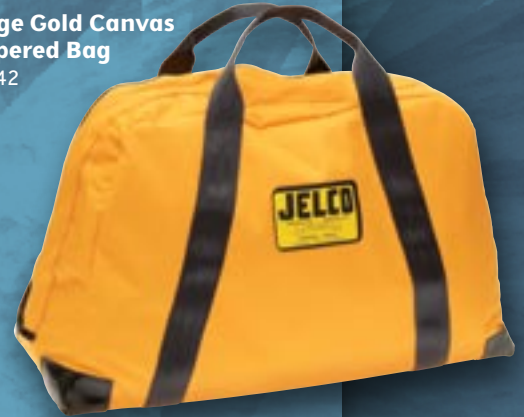
Large Gold Canvas Zippered Bag 84242